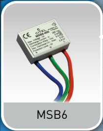
SPD FOR ARCHITECTURAL OUTDOOR LIGHTING