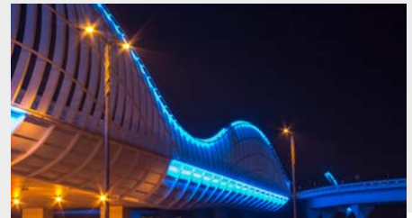
Architectural outdoor lighting