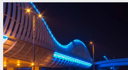
Architectural outdoor lighting